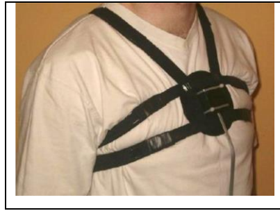
Figure 3.1. Caption about first image